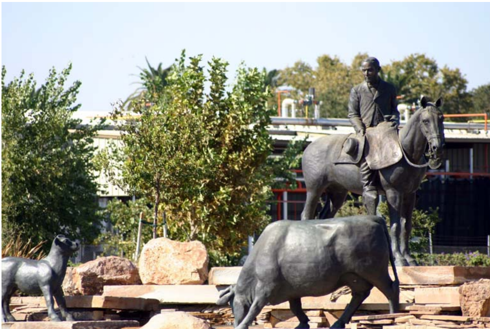
Henry Miller Plaza, Los Banos

The January board meeting will be held in Los Banos