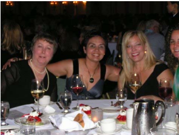
More California Clerks enjoying the Presidential banquet