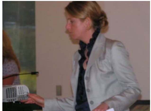
One of the guest speakers