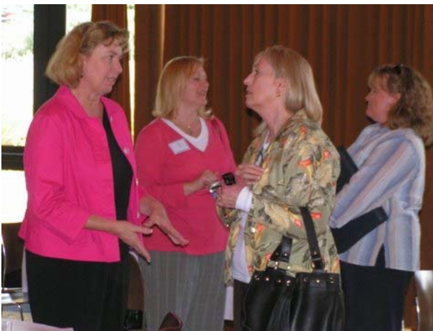
City Clerks networking during break