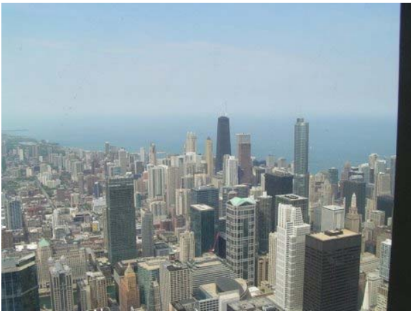
View of Chicago Skyline from Hancock Building