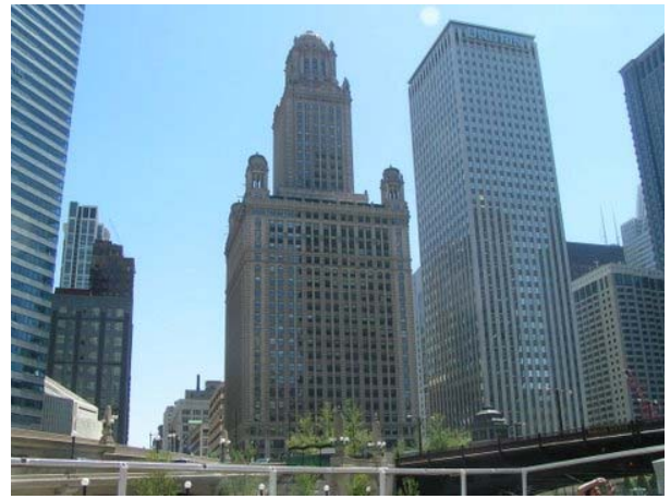
A scene from an architectural river boat