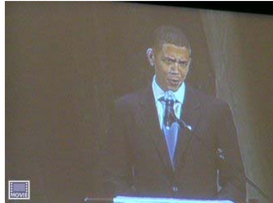
President Obama Impersonator