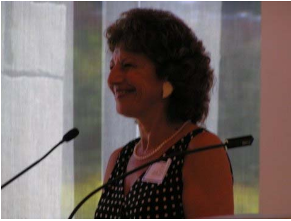
One of the guest speakers