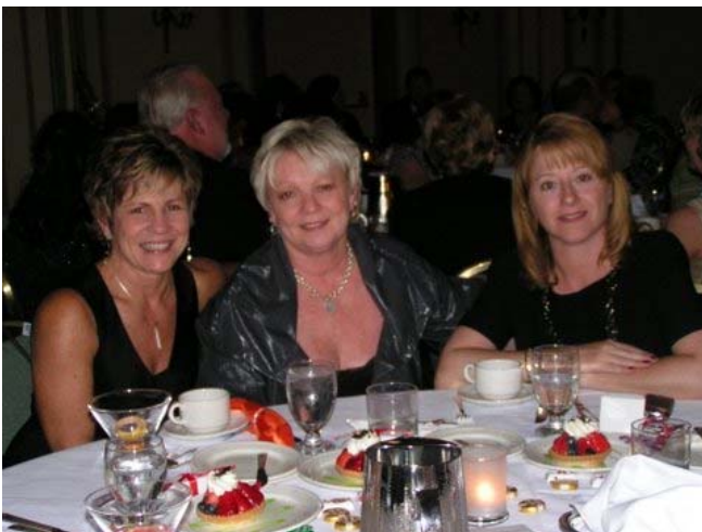
California City Clerks at the President's Banquet