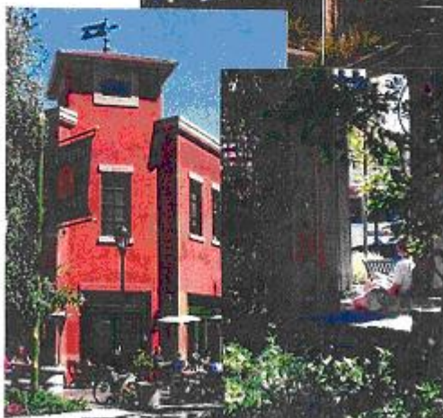
La Fiesta Square